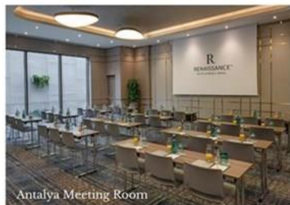
Antalya Meeting Room