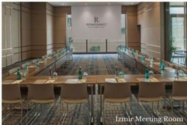
Izmir Meeting Room