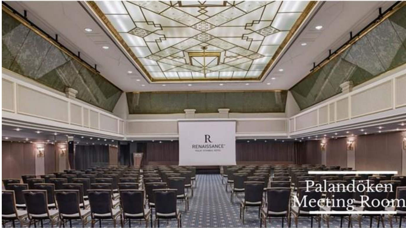
Palandöken Meeting Room