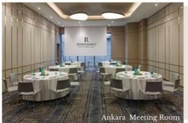
Ankara Meeting Room