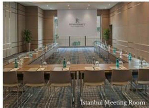
Istanbul Meeting Room